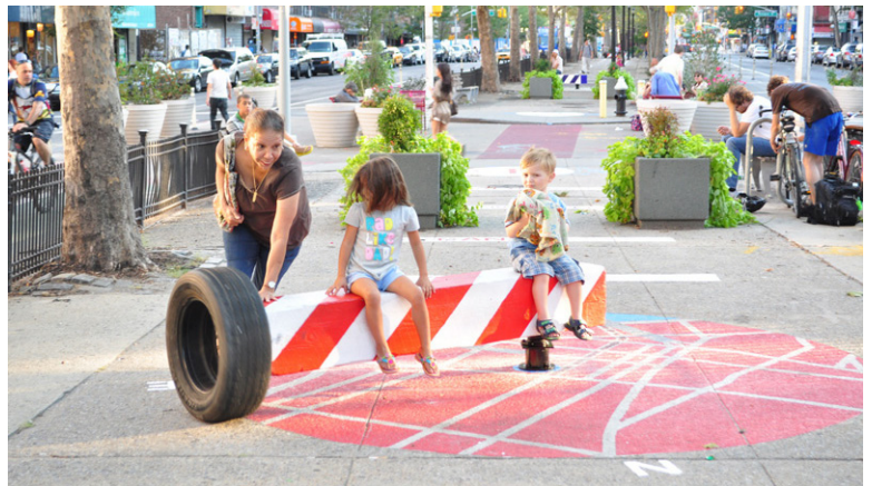
Mall-terations art installation on Allen Street pedestrian malls by Hester Street Collaborative - 2010