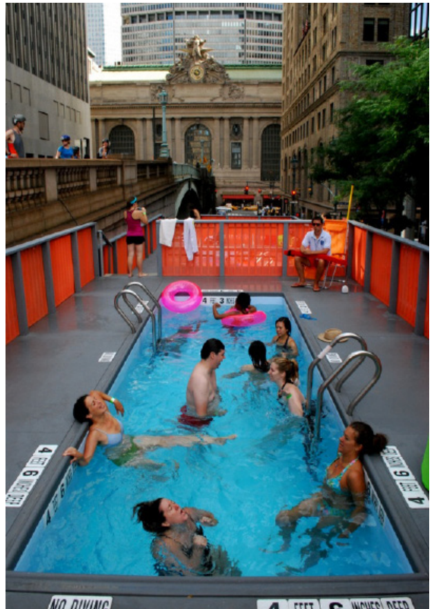
Dumpster Pools at Summer Streets along Park Ave. by Macro-Sea with the NYC DOT