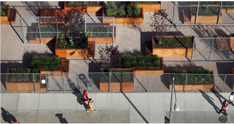
LMCC's Lent Space at a stalled development site in Tribeca by Interboro - 2009