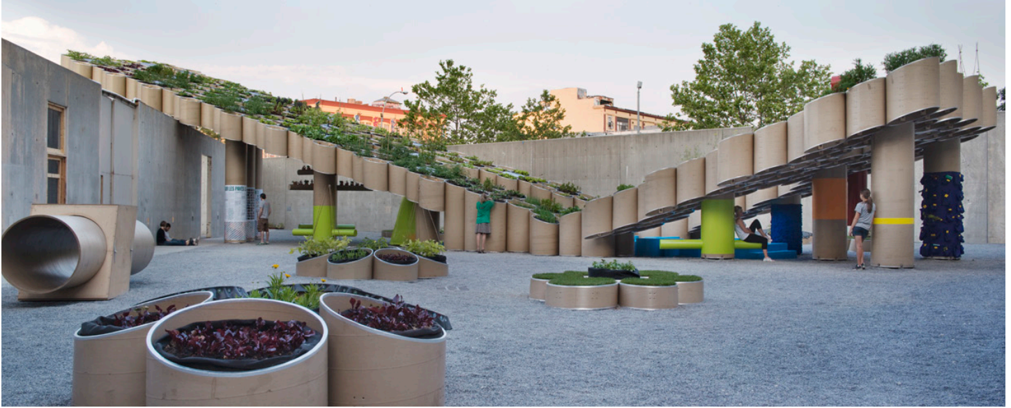
P.S. 1 installation - Public Farm 1 by Work AC - 2009