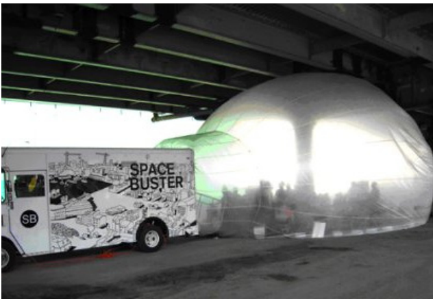
Spacebuster temporary event space beneath BOE by Raumlabor with Storefront for Art and Architecture - 2009