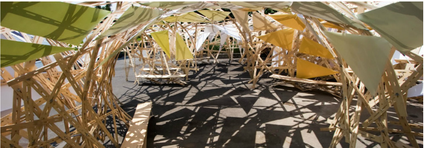
Solar 1 temporary pavillion in Stuyvesant Cove Park by Situ Studio - 2008